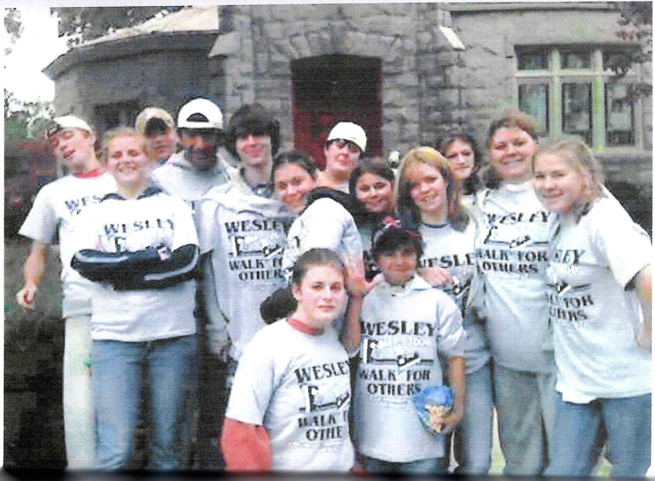
Wesley Walk for Others