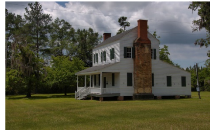
Seaborn Goodall House

Everywhere he went he attracted large crowds to his thundering sermons. "...Dow's public speaking mannerisms were like nothing ever seen before among the typically conservative church goers of the time. He shouted, he screamed, he cried, he begged, he flattered, he insulted, he challenged people and their beliefs. He told stories and made jokes. It is recorded that Lorenzo Dow often preached before open-air assemblies of 10,000 people or more and held the audiences spellbound..." 2 It was claimed that he preached to more people than anyone else and he was an important figure in the Second Great Awakening. His autobiography was the second best-selling book in the United States, surpassed by the Bible. Not all itinerant preachers were as dynamic as Dow but you can rest assured that they thundered out their message.