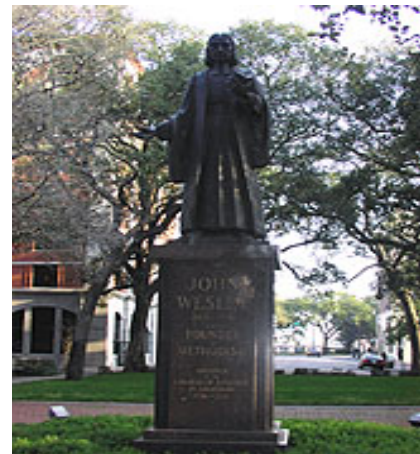
Statue of John Wesley in Savannah, Georgia